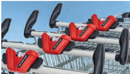
Always close at hand

The smartphone holder can be retrofitted to almost all shopping trolley handles and gives the market a modern, innovative image.