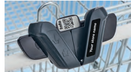
Customised with label