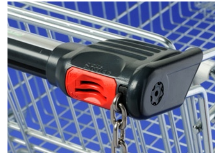
Also available with two coin slots.

Time saving: The coin cassette can be exchanged within seconds. The clever euroloc design is cost saving, it makes the right end cap redundant.