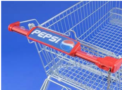
Space for advertising clip.

With the new euroloc, the shopping trolleys will lead with style. Its ergonomical design as well as extreme sturdiness are the two outstanding features. Placed on the right end side, the entire handle is a nice and undisturbed ad space.